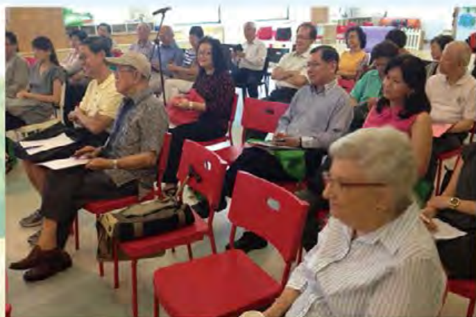
audience getting their "Act" together