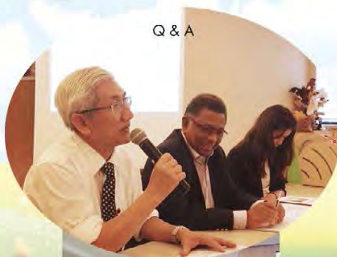
Q & A